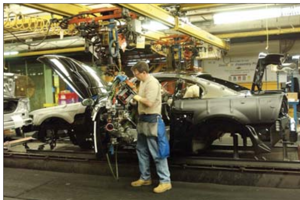
The effects of buyouts and production cuts among automakers and their suppliers will likely be felt strongly in Michigan in 2007.